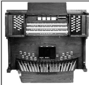
Phoenix Custom Organs The new standard of excellence

EveryPhoenix Organ is custom built to best suit the needs of your congregation.